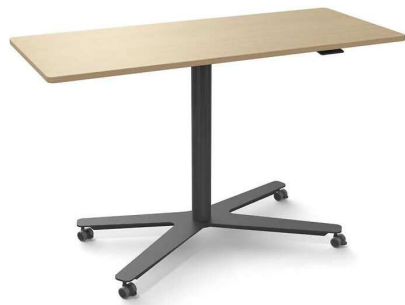
Table top size 120 x 50 cm round corners X-base and round column Pneumatic height adjustment 72-117 cm with castors Recyclable package includes recycled materials when available (plastic, carton).