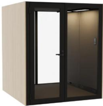
Material weight (kg)

Recyclable package includes recycled materials when available (plastic, carton).