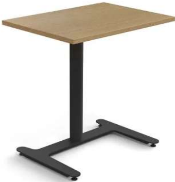
Table top size 70 x 50 cm H-base and round column Pneumatic height adjustment 70-115 cm with glides Recyclable package includes recycled materials when available (plastic, carton).